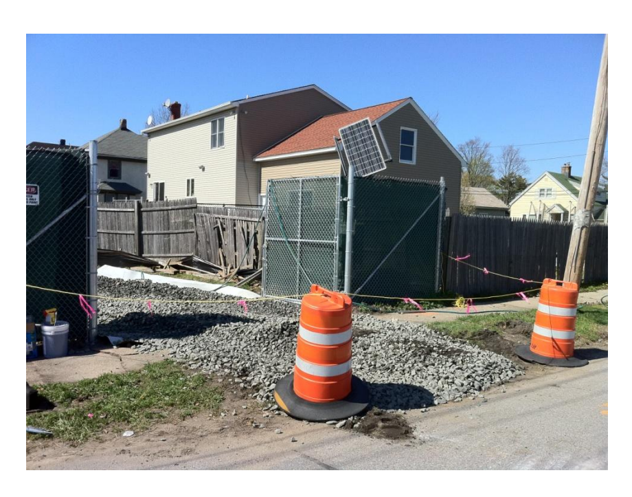
Finished Anti-Tracking/Decontamination Pad